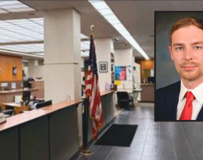
Front lobby area with updated fixtures that create a brighter, more welcoming entryway.