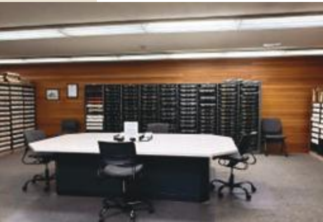
Upgraded lighting in the records room improves visibility and reduces maintenance needs.

Kankakee County’s success shows energy efficiency investments pay off in more ways than one—lower costs, more comfortable workplaces, and a reduced environmental footprint. Counties looking to save money and update their buildings can turn to programs like the ComEd Energy Efficiency Program to make smart, practical improvements.