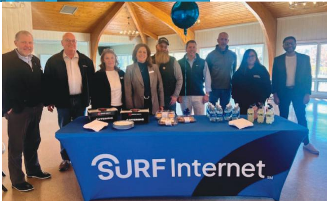
Members of the Lake Wildwood Association, representatives from the Illinois Office of Broadband, Marshall County leaders, and the Surf Internet team gathered on Nov. 6 at Lake Wildwood, outside of Varna, Ill., to celebrate new fiber construction made possible through the Connect Illinois program and private investment from Surf Internet.

Surf Internet is an innovative fiber-optic internet company that serves as the essential gateway to connectivity across the Great Lakes region of Illinois, Indiana, and Michigan. Learn more at https://surfinternet.com .